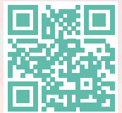
Bird Group Telegram

Events online and physical are being planned around the world, check worldivermectinday.org and follow birdgroupuk on Telegram.