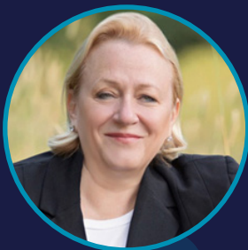
Catherine Austin Fitts

19.00 – 22.00 BST | 20.00 -23.00 CET | 2PM – 5PM ET